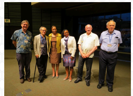
Photos: Lecture at OIST