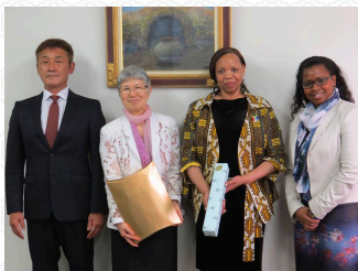
University of the Ryukyus