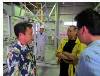
Trim Co., Ltd.